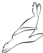
Northern Fur Seal

Humans are at the top of the food chain. This means that we are a top-level predator. We benefit from all the energy that has been put into a food chain.